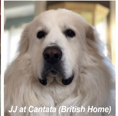
JJ at Cantata (British Home)