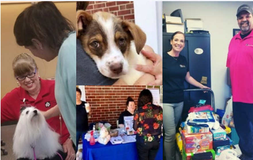
Left: Elkay Manufacturing | Middle (2): Hinsdale Bank & Trust | Right: Flavorchem

The employees of Flavorchem's Downers Grove headquarters, ran a donation drive and fundraiser for HHS and delivered loads of great supplies to the shelter. Flavorchem creates and manufactures flavor and color solutions for the food, beverage and nutraceutical industries. We recently had the opportunity to thank their hard working staff, by visiting them with our Pet Therapy teams on their Employee Appreciation Day. Visit flavorchem.com