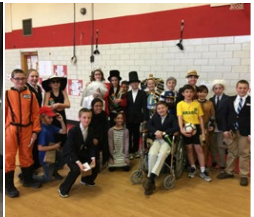
Students from Field Park Elementary in Western Springs donated funds from their Wax Museum presentation of famous historical figures.

Big thanks to our youngest supporters who are making a difference in the lives of animals. From donating their own allowance, birthday and holiday money, and creating their own online fundraisers, hosting lemonade stands and bake sales, to babysitting gigs, going door-to-door, selling bracelets, making blankets, and making announcements at school, these young people are true entrepreneurs with big hearts!