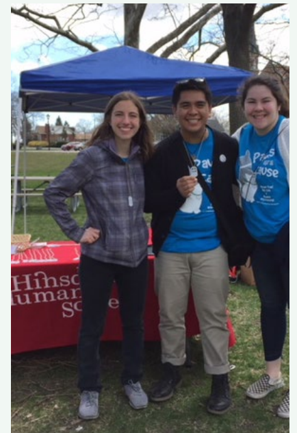
Team members from the Addison Trail High School Key Club.

The Addison Trail High School Key Club created their very own Paws for a Cause Event to raise awareness about pet adoption. Their event featured many local animal rescue organizations including HHS. We continue to be amazed by the dedication to our animals and we look forward to Paws for a Cause becoming an annual event!