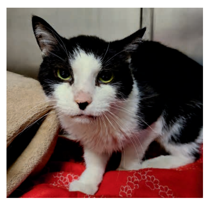
Don our hyperthyroidism kitty

Following are just a few of the animals that recently needed our help. Thanks to you, we were able to give it to them.